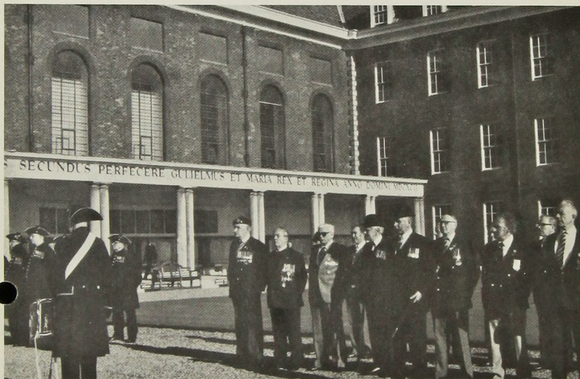
OLD COMRADES ON PARADE AT ROYAL HOSPITAL CHELSEA