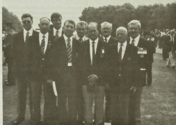
The Hounslow Nine