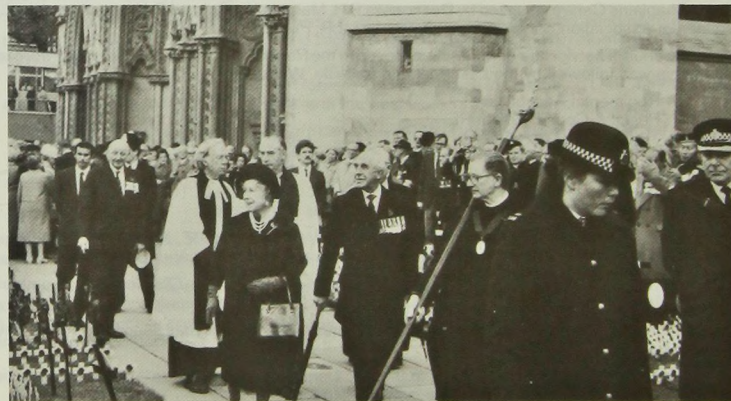
Inspection by H.M. Queen Elizabeth The Queen Mother

The attendance was fairly good but I am sure with a little more effort it could be much better.