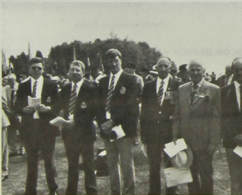
Our President on Parade

So within a short period we had visited the tragic killing grounds of our Grandfathers, where now countless British tourists pass through on their holidays to Europe, that in 1916 and 1917 were truly 'Hell on Earth'.