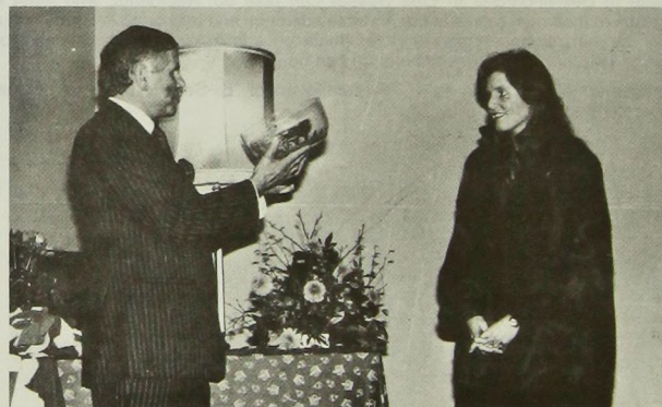
The Brigadier makes his Mark

Our chairman has also landed safely and is back on terra-firma.